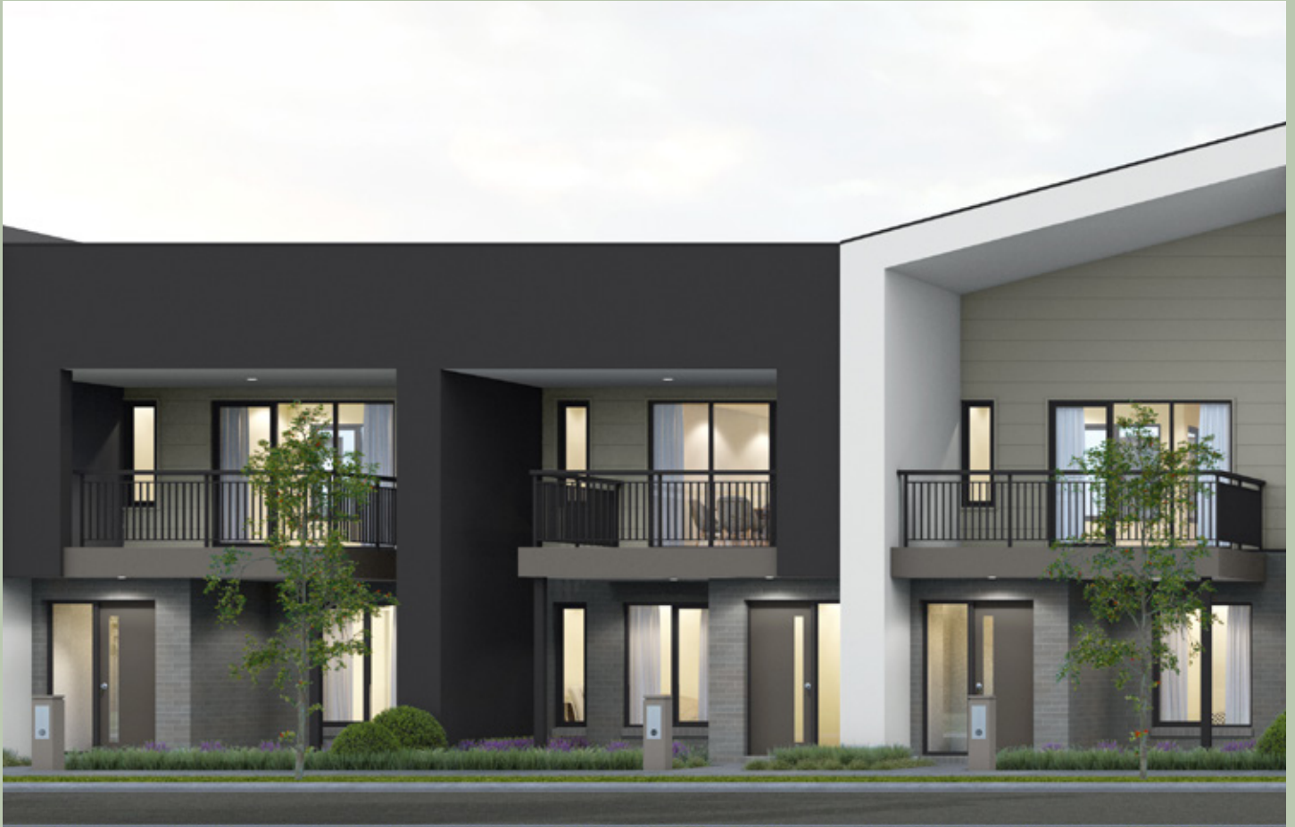
Image depicts items not supplied by Metricon namely landscaping and fencing.